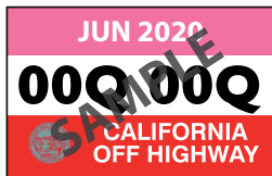
Red Sticker Page 6