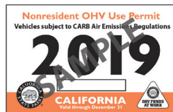
Nonresident OHV Permit Page 13