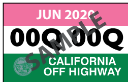
Green Sticker Page 5